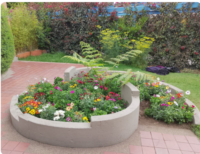
Pollinator Garden in NB school.