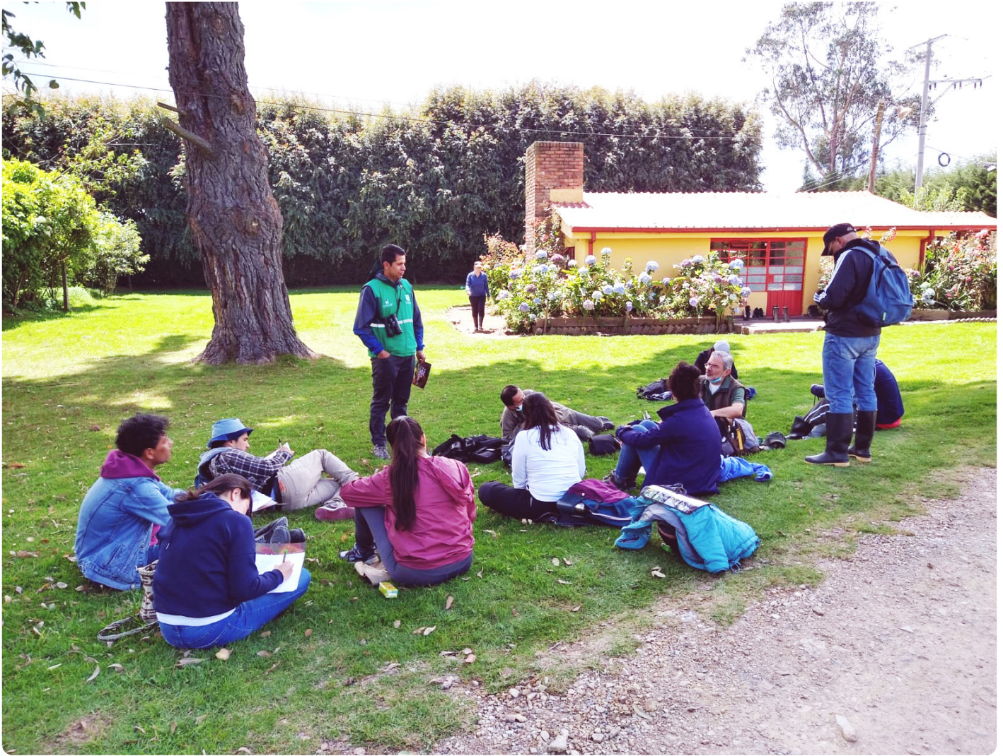
Birding workshop in Las Mercedes Forest.