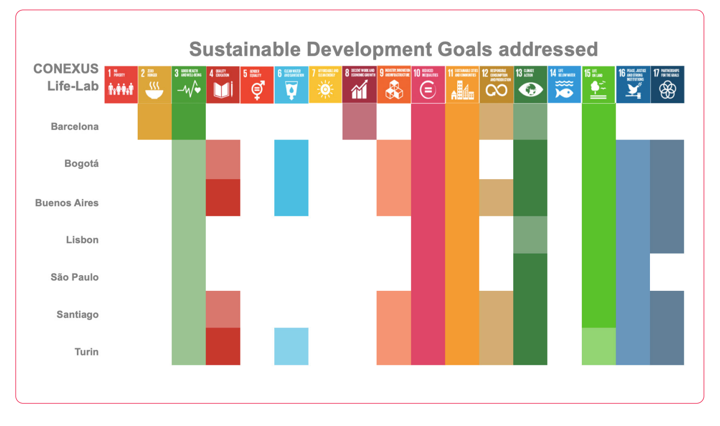
Figure 2: Overview of CONEXUS' cities contributions to the UN SDGs.

10 Frantzeskaki et al. (2023). Governance of and with nature-based solutions in cities. In: McPhearson, T., Kabisch, N., & Frantzeskaki, N. (Eds.), Nature-Based Solutions for Cities, Edward Elgar Publishing.