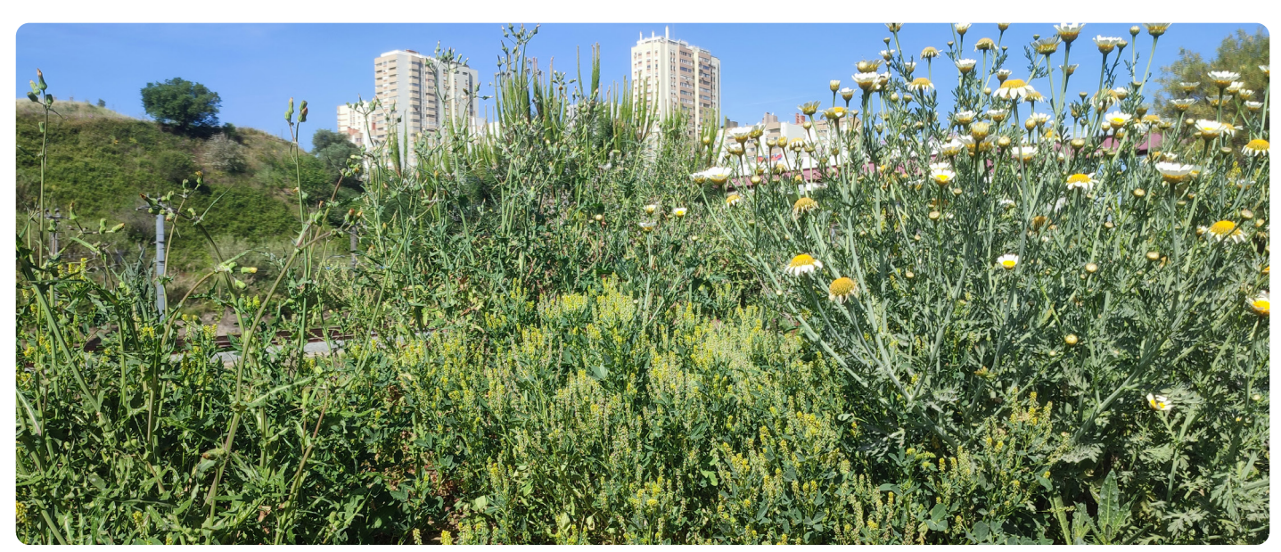
Lisbon's urban nature.

the typology, objectives, and socio-ecological conditions of the NbS in question. As a result, mapped SDG contributions for the same type of NbS might vary depending on the implementation approach, scale, geography, and stakeholders involved and/or targeted and will rely, in part, on implementers' self-assessment.<sup>12</sup> Moreover, while some NbS indicators can be used as proxies for SDG ones, other indicators are highly context-specific and can thus offer complementarity to global sustainability benchmarks such as the SDGs. This is particularly observed for local indicators tracking 'Biodiversity Enhancement',<sup>13</sup> a core aspect of NbS, which is not traditionally integrated into most urban assessment frameworks.