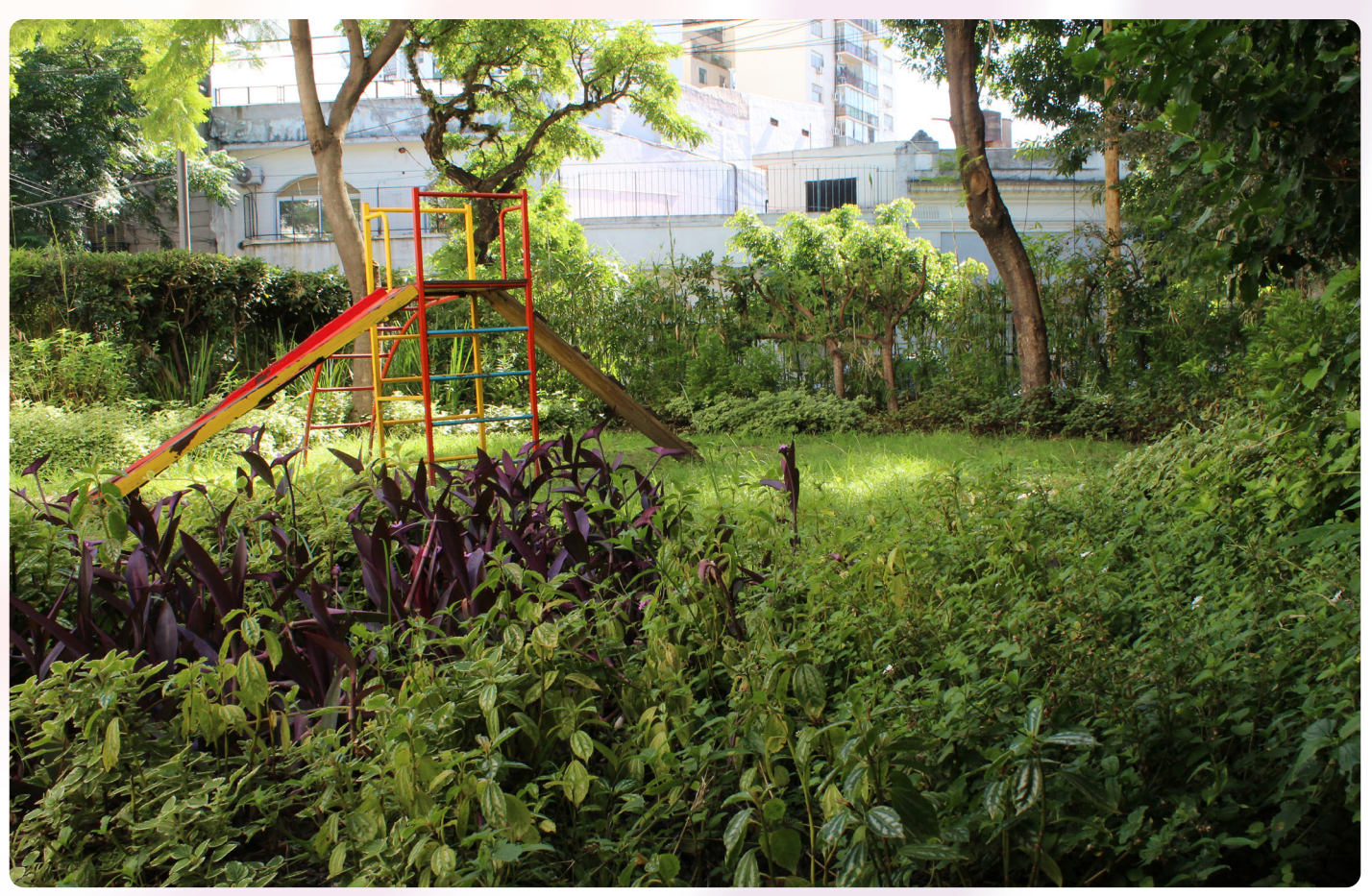
Buenos Aires' Breathe/Respirar pilot.