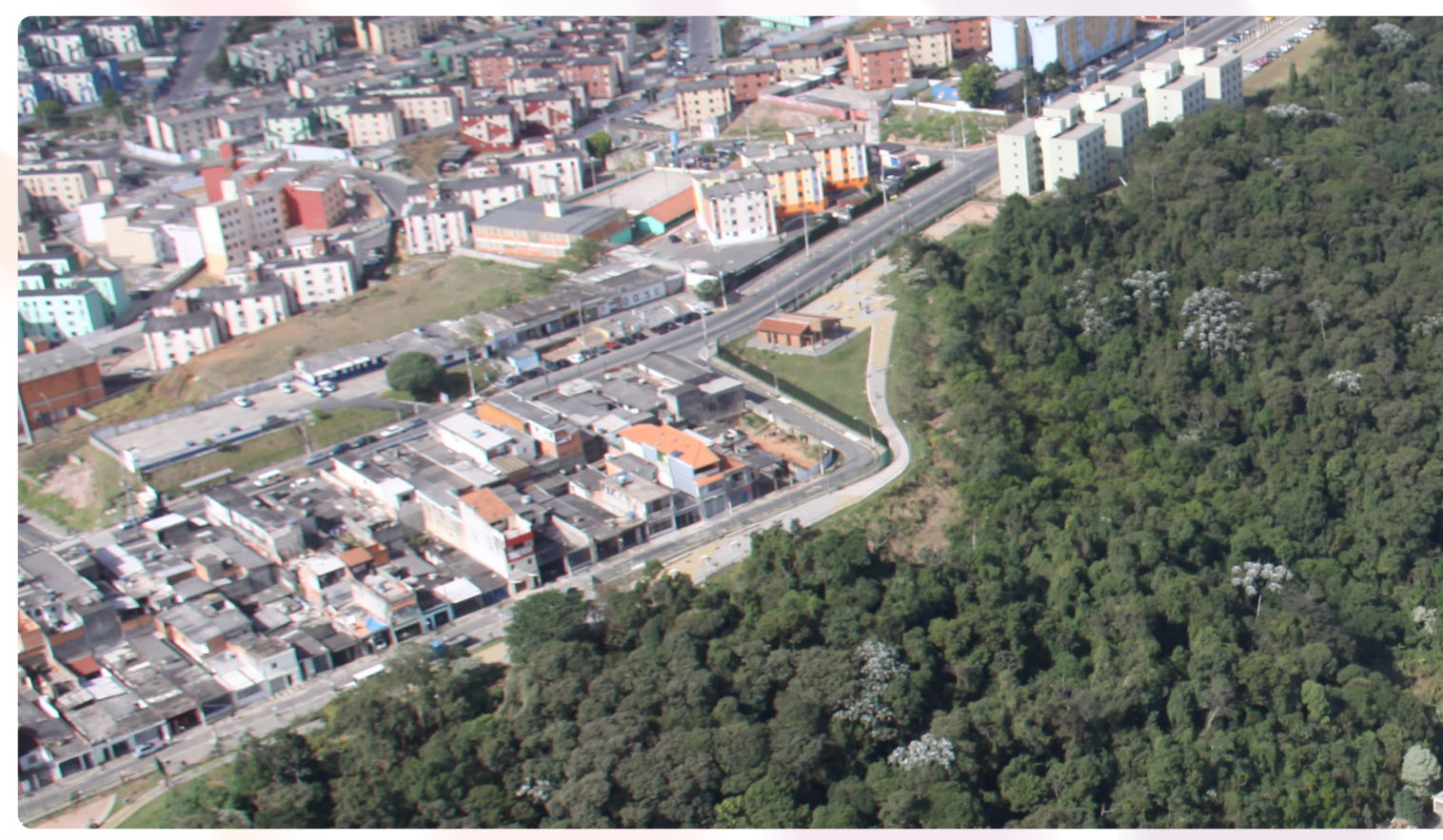
São Paulo's green corrid<mark>or. IMAGE</mark>: Prefeitura Municipal de São Paulo