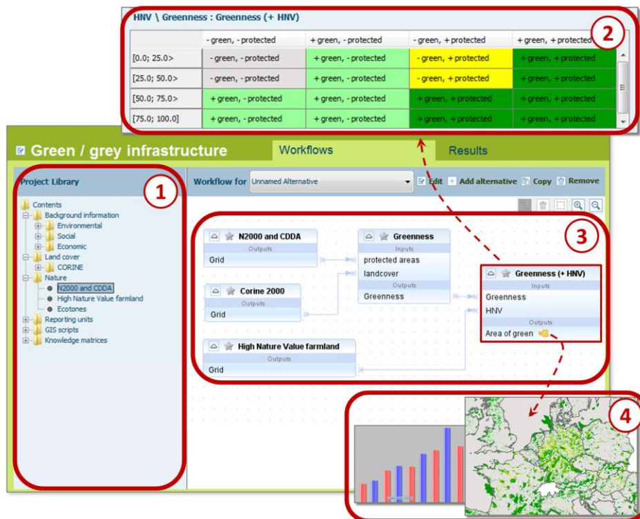
Figure 1. Collection of screenshots of the QUICKScan tool, showing its project library (1), rule definition (2), combinational workflow (3), and resulting maps and graphs (4).